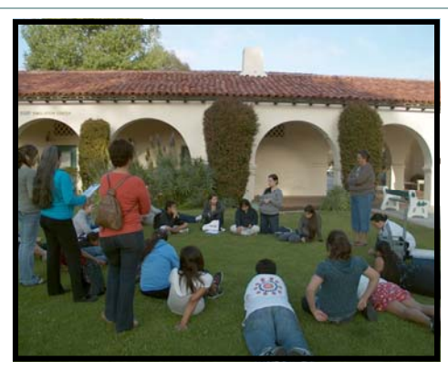
Students at SDSU