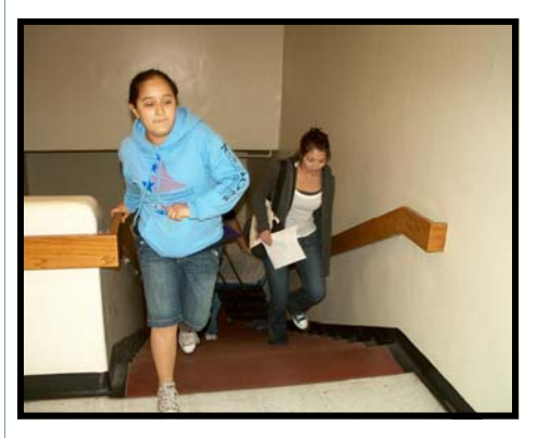
Students at SDSU Astronomy Lab